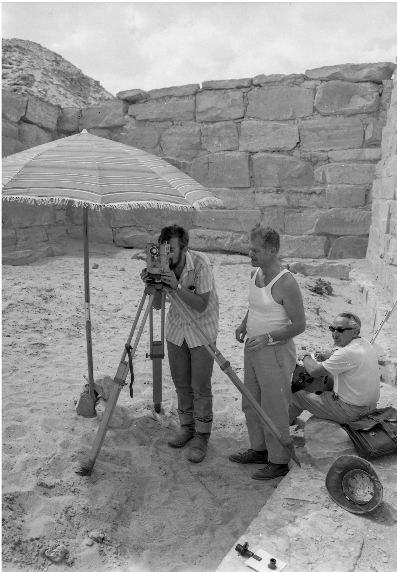
Fig. 3 Geodetic measurement with the theodolite Zeiss Theo 010 in the boat-shaped room of the mastaba of Vizier Ptahshepses