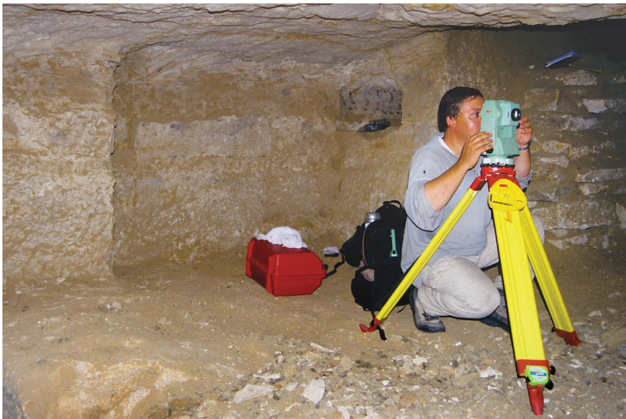
Fig. 1 Geodetic measurement in the burial chamber of vizier Qar (AS 16)